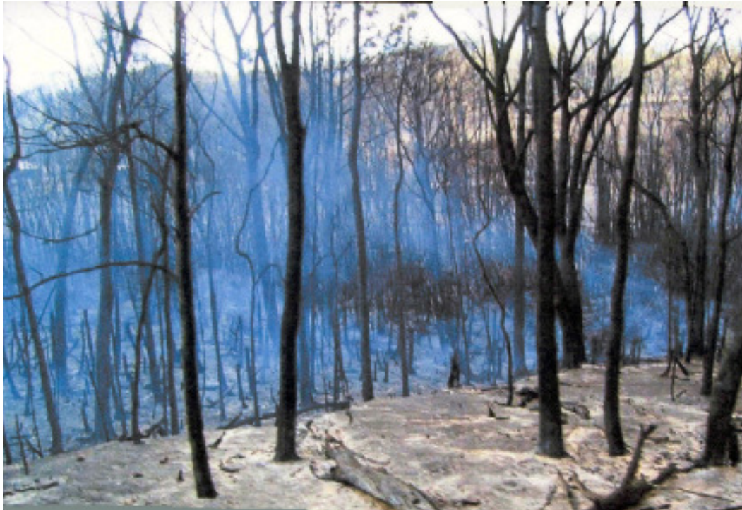
Victorian bushfires February 2009

...The consequences of climate change and demographic change may be substantial in coming decades. Both researchers and policymakers should take into account the linkages between them (emphases ours).