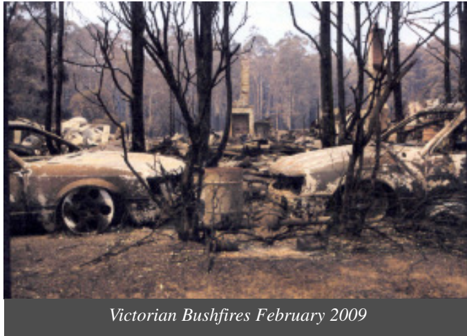
Victorian Bushfires February 2009

2007 Australian of the Year Dr Tim Flannery notes that in 1961 when the world had three billion people, they were using only half the total resources that our global ecosystem could sustainably provide. By 1986, however, as the population topped five billion, they were using all of Earth's sustainable production. This can be deemed to be the year that humanity reached the Earth's carrying capacity, that is, its limits. By 2001, with six billion people, we were 20 per cent over budget and in 2050, when we reach nine billion, we will need nearly two planets worth of